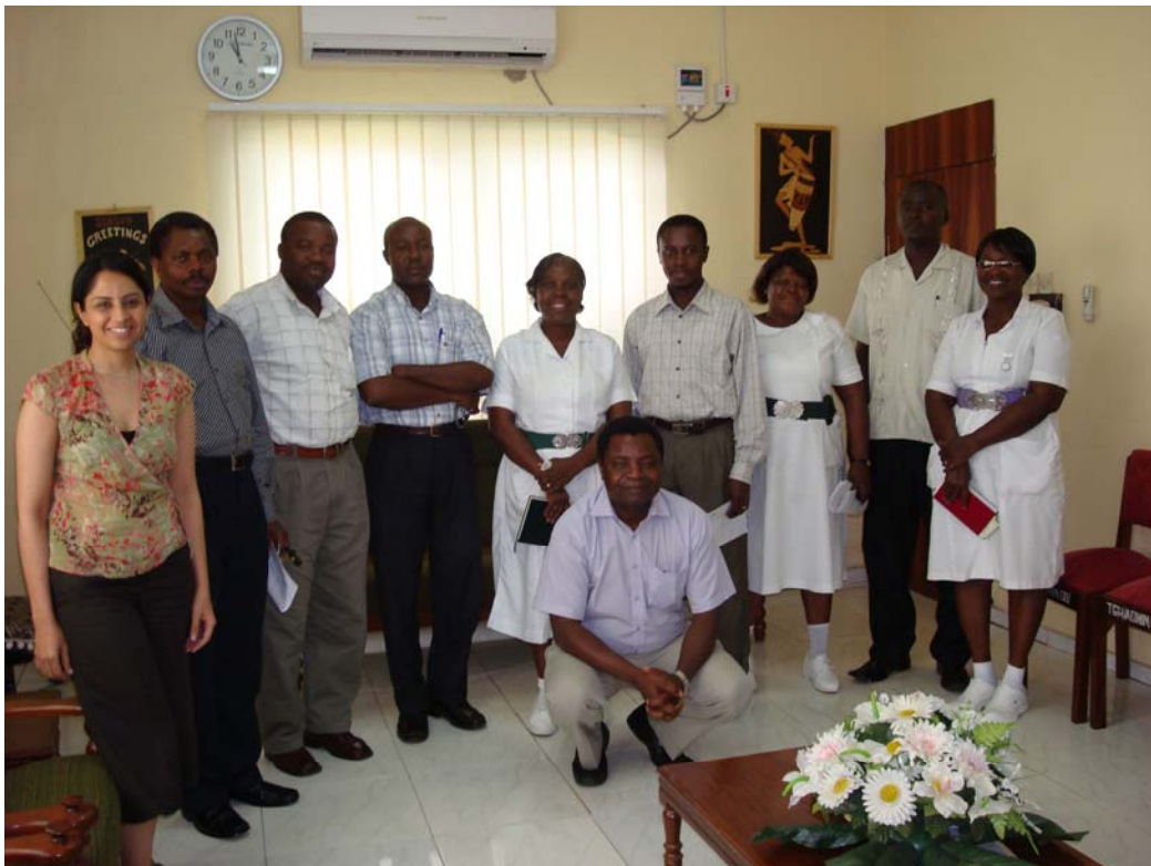
TEMA GENERAL HOSPITAL: Motec with hierarchy of TGH. Collaboration planned