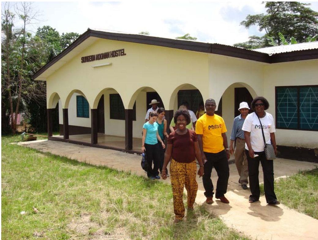
Motec at Pramso St Michael's Volunteers Residence