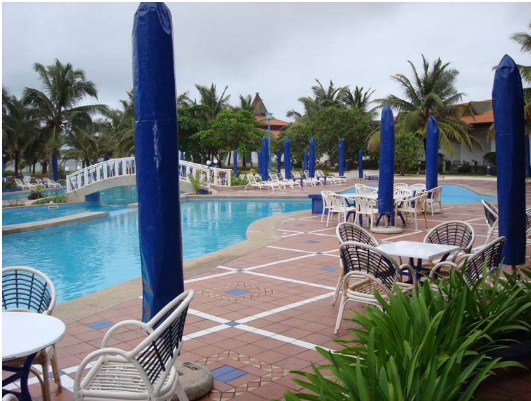
La Palm Beach Hotel in Accra where a night is a minimum of about US$400