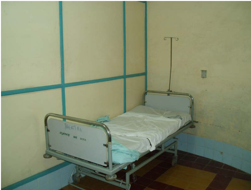
A recovery ward waiting to be supported.