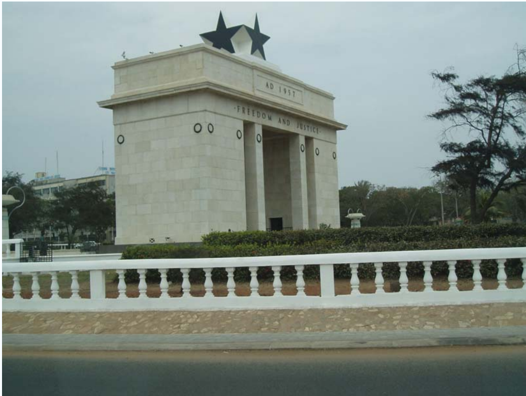
Symbol of state, freedom, hope and responsibility.