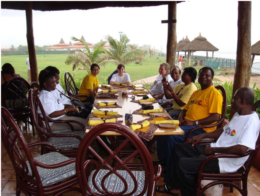
Motec's Social Evenings