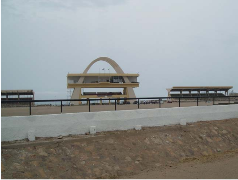
Independence Square in Accra