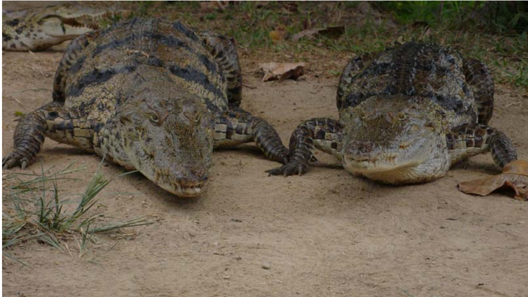
Till Hunger do we part. His and Hers at Kakum Park near Cape Coast.

Motec will try as an organisation to part sponsor social evenings. A contribution of £50 per member will provide memorable and decent evenings for the entire visit.