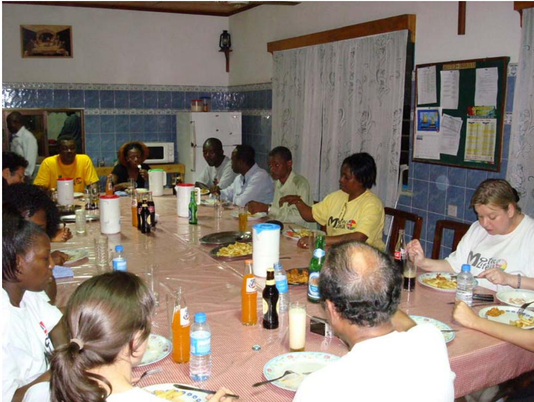
Meal time with host, Koforidua St Joseph's Dining room.