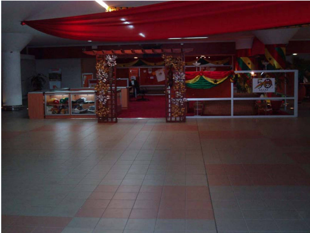
Accra Airport (Kotoka) celebrates Ghana's 50th anniversary.