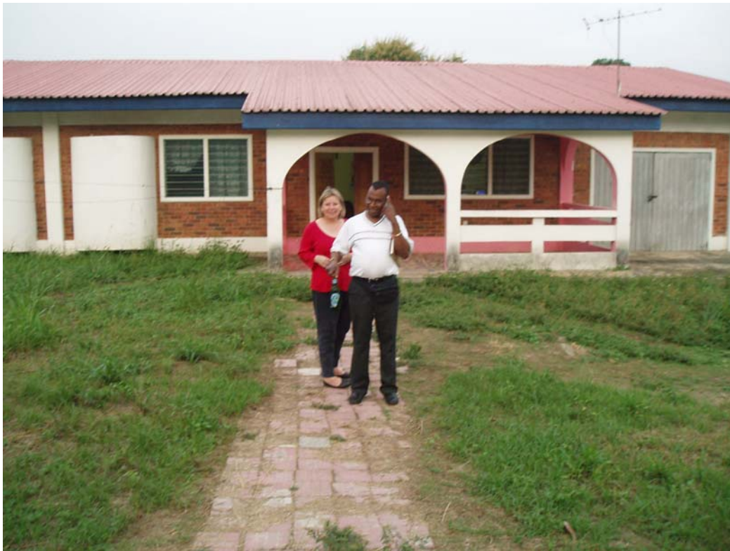
Koforidua, main residence - Main accommodation for four.