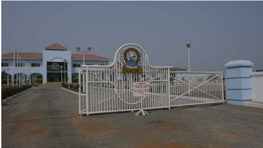
KOFI ANNAN PEACE KEEPING TRAINING CENTRE- ACCRA

Man should endeavour to keep the peace and promote good health. Peace and good health cannot be easily measured but can be fully enjoyed even in the silence of our hearts knowing that we have pledged to contribute our quota.