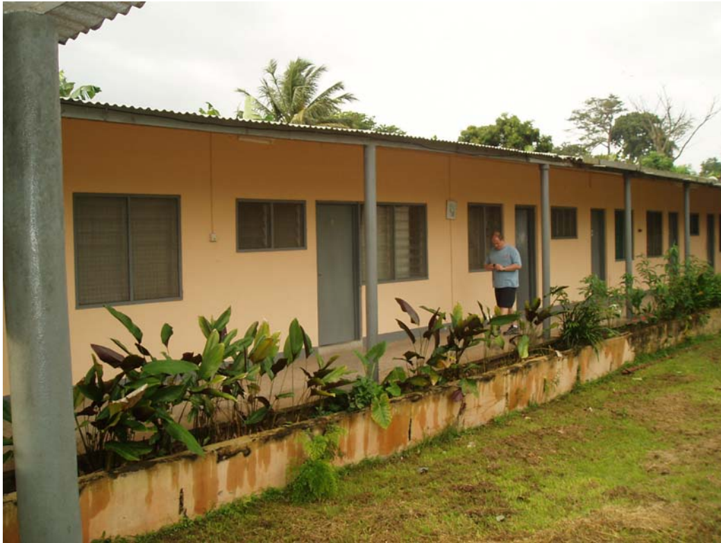
Koforidua Residence1..self-contained: sometimes used by Motec.