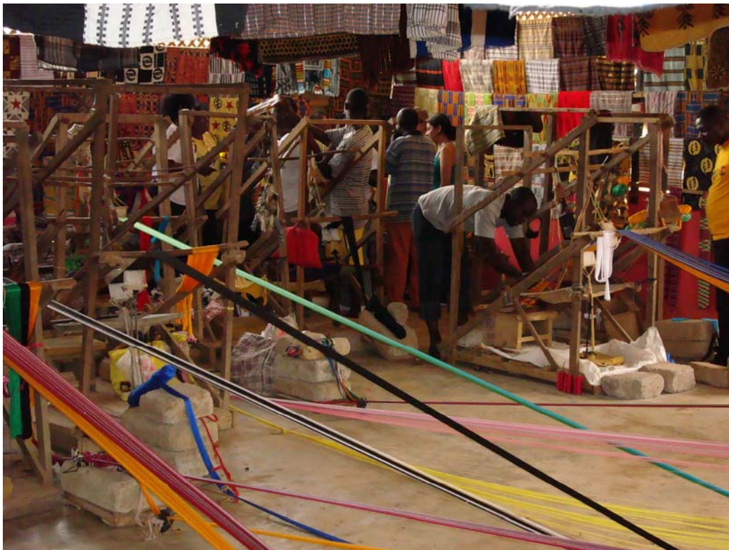
Kentei weaving Centre at Bonwire in Ashanti

Bonwiire in Ashanti is the a town noted for large scale production of kente. Usually woven as small strips and joined together in bales. Originally called 'nwontoma' – the woven cloth, it is popularly called kente. The name kente is believed to originate from the 'basket' which is a special bag woven from the bark of the raffia tree. In akan, basket is ' kenten ' and the cloth woven in a similar fashion was then called ' kente '. Other tribes like the Ewes also make a variation of style and colour of Kente. There are other ethnic tribes who probably 'migrated' from Ghana who make Kente in West Africa and the West Indies.