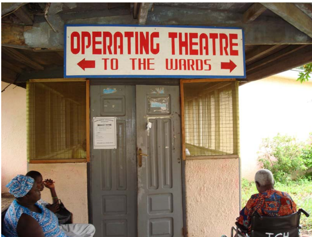
An Old theatre needing replacement: patients could be waiting no more.