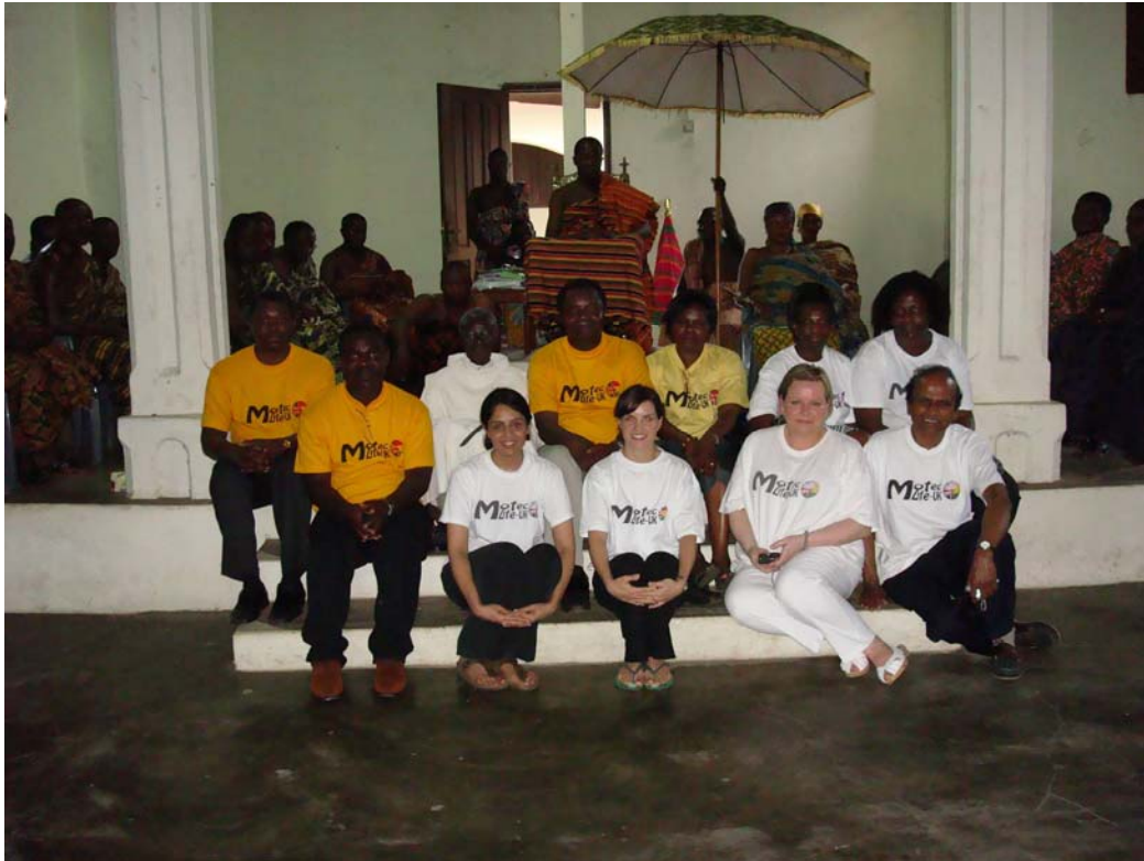
Motec as guests - Koforidua Traditional Council Meeting