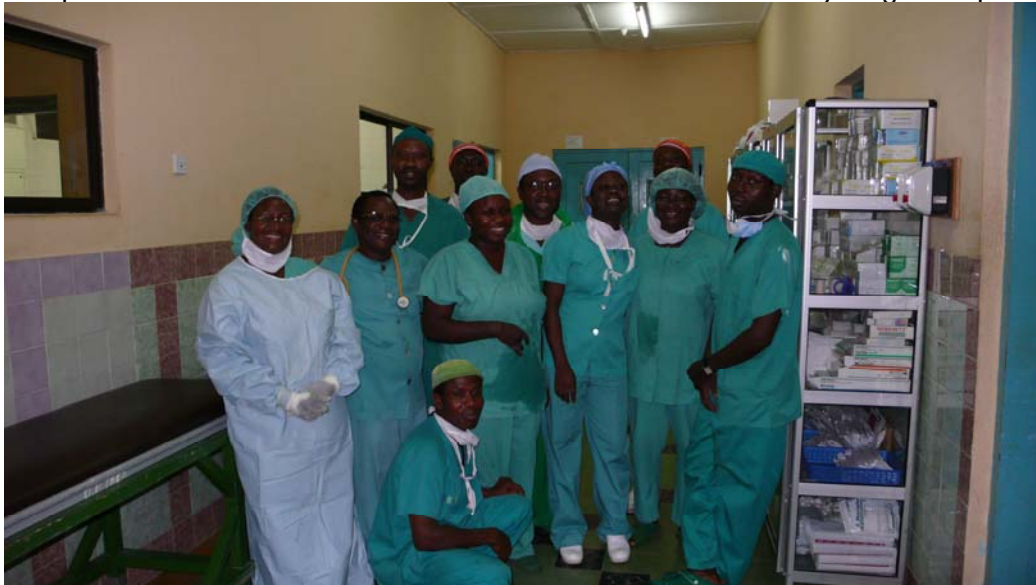
Theatre staff, St Joseph's Koforidua

But with several Motec sub groups, it is anticipated that all the hospitals will co-operate with travel and tour to minimise the burden on any single hospital.