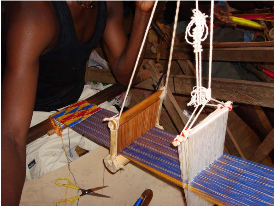
Kente Stole(strip) in the making

b) Adinkra is another traditional cloth. It is believed to have originated from a tribe