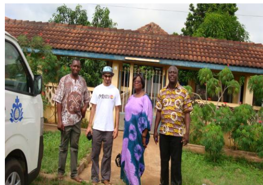
The Surgical Centre at Sefwi Asafo in the Western Region in June and before in April

The Jirapa team embarked on an intensive teaching programme at the Nurses, midwifery and community colleges. Lectures were well attended by both students and tutors. Lectures were interactive and the rooms were