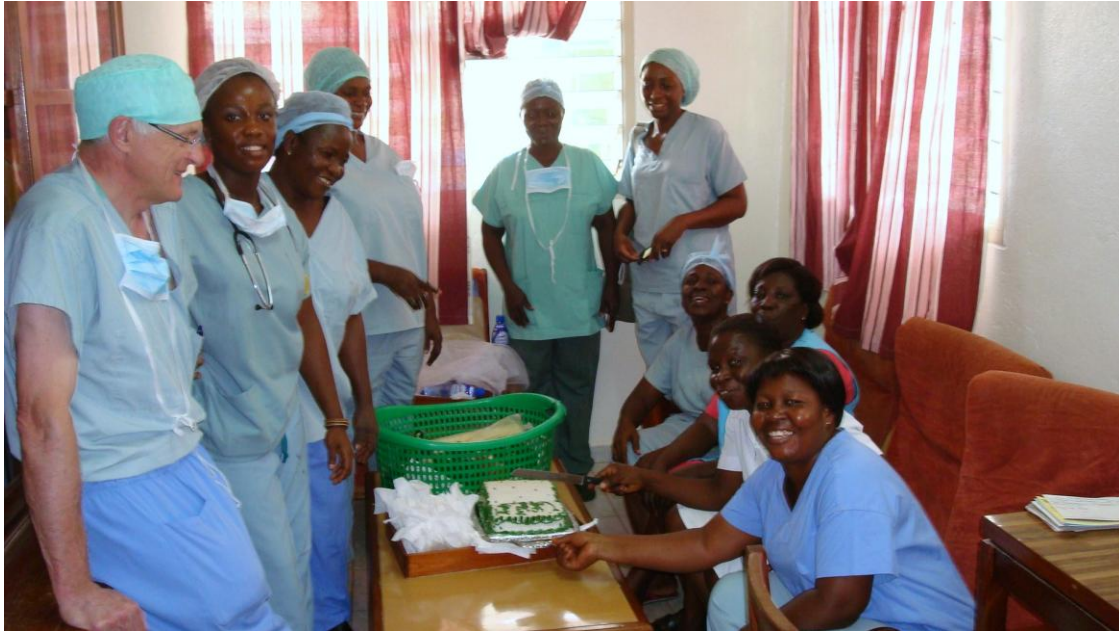
The sweet farewell where cakes, sandwiches, drinks were enjoyed by Motec volunteers and theatre staff of Nkawkaw Holy Family Hospital.

Motec Trustees wishes to thank volunteers for the marathon of sacrifices and hard work by the volunteers. Also Motec expresses her gratitude to the host hospitals who did look after the teams very well throughout. Akosombo VRA, Nkawkaw Holy Family, Sefwi Asafo, Koforidua St Joseph's Hospitals were excellent, as always. Also Asante Kotoko football club for the social evening and Komfo Anokye Hospital for organising the Trauma Centre Tour.