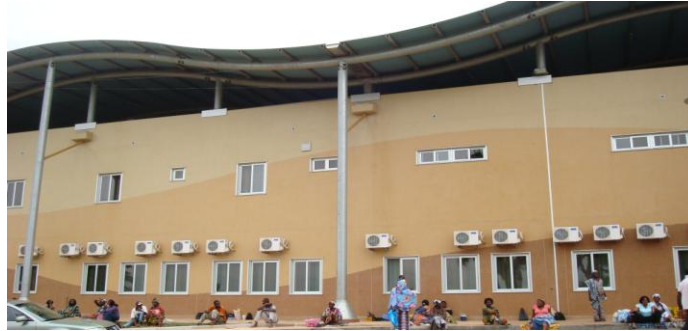
The Modern Trauma Centre at Kumasi Teaching Hospital, largest in sub-Saharan Africa