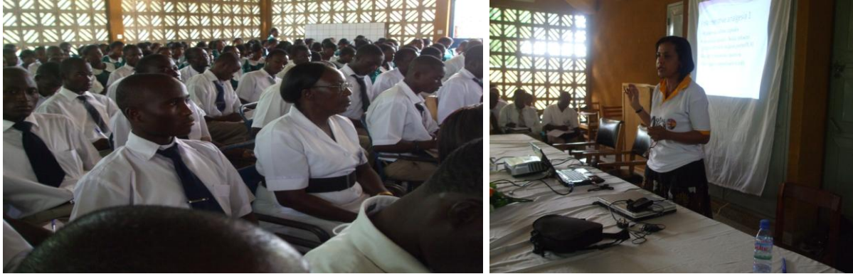
Lecture time at Jirapa

Motec's lecture series during the visit included the following: