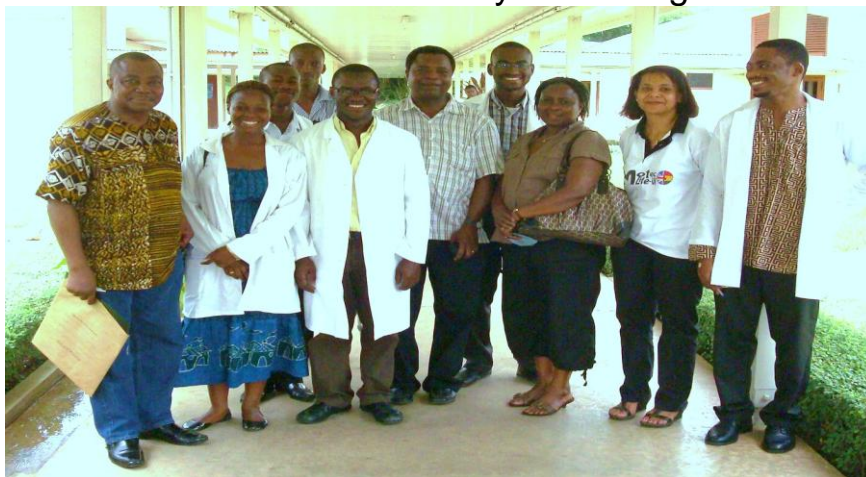
Motec Recourse Personnel with resident doctors, final year medical students at Akosombo.