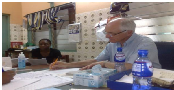
Clinics and pre-op assessments were heavy.