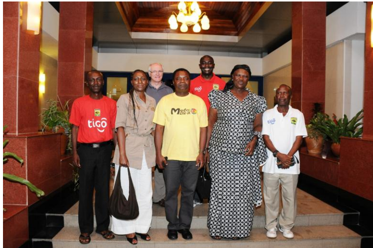
Motec and Asante Kotoko hierarchy in Kumasi stand shoulder to shoulder

fully packed with an average attendance of about 200 students. The team also exchanged ideas on clinical care which led to Motec adopting one malnourished patient. The team stayed for four nights in that hospital. The hospital and people of Jirapa were very appreciative of Motec's working visit. The volunteers found the people of Jirapa very friendly and welcoming.