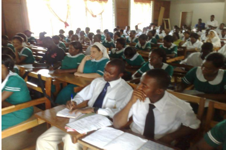
Lecture time at Nkawkaw Nurses College