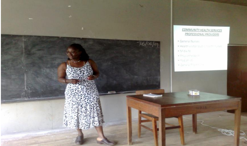
Felicity on Community Education near Nkawkaw